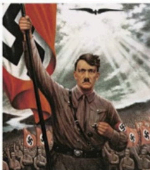
▲ German poster of Adolf Hitler, 1930s

Sugihara knew what was happening. He found a way to help Jewish refugees and, in doing so, risked his own life. Sugihara saved the lives of thousands of people and has come to be considered a hero. Hitler was eventually defeated and World War II ended in 1945, but not before more than 6 million innocent Jewish people died.