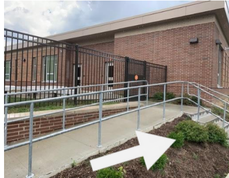
Step Two Walk up to the ramp to Gate 32