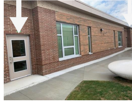
Step Three Sign student out at the classroom door.