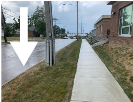
Step One Park along Larchmere